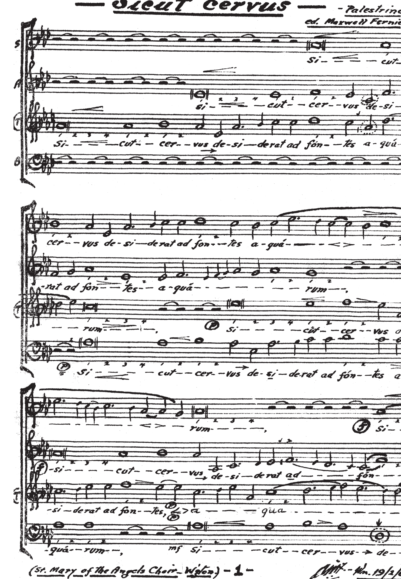
© The Estate of A.M.Fernie Reprinted by the Choir, November 2005